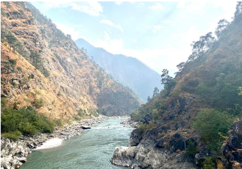
Figure 3: Location of the dam site